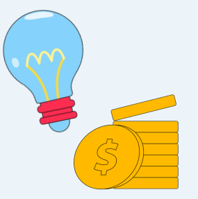
On-going fundraising strategies are in place.