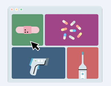
BACI has key policies and procedures related to the health and safety of persons served and employees.