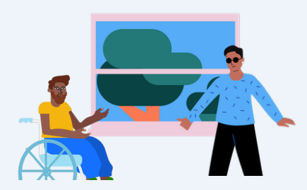
OSH Committee addresses current workplace issues as well as develops and implements an annual action plan.