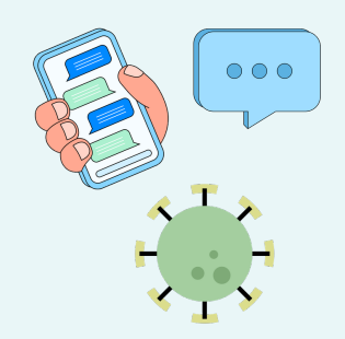
BACI will provide training and resources related to Covid-19 and mental health.